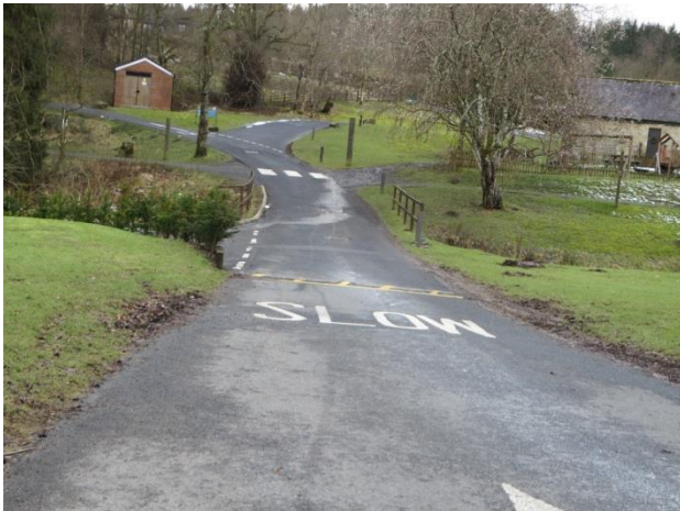
1. Route up from visitor centre