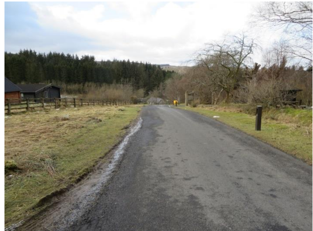
2. Route up from visitor centre