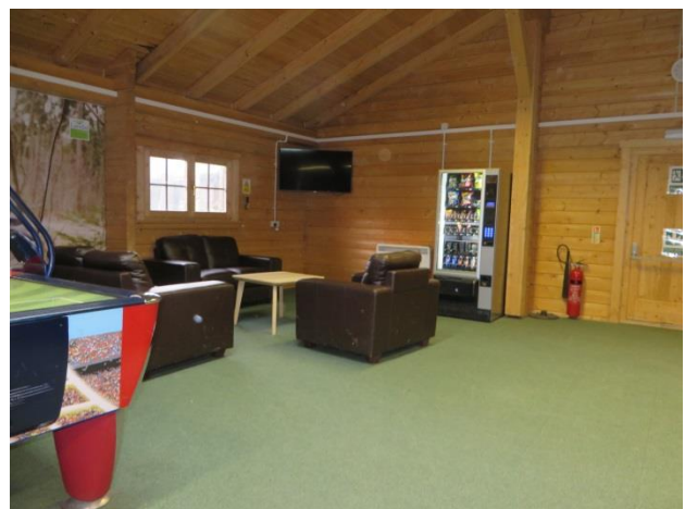
6. Internal space and