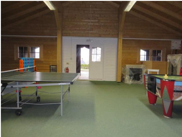
7. Internal spaces.