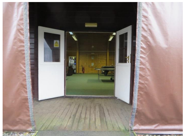
4. Covered Entrance.