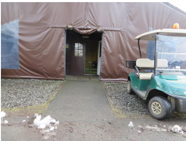
3. Approach to games room 1 in 17.