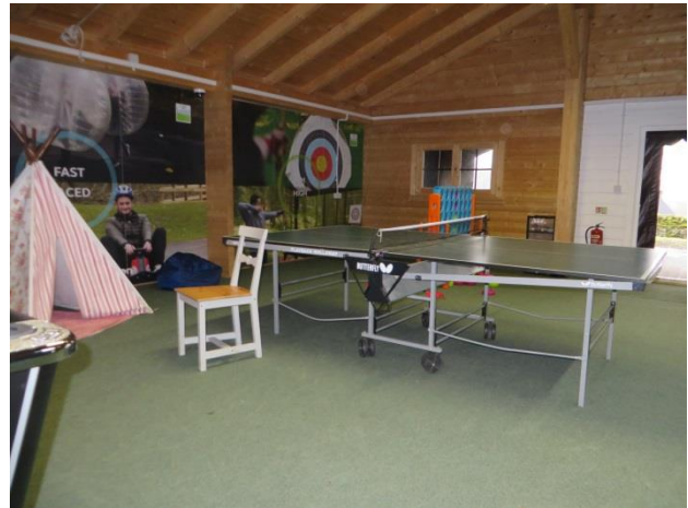
8. .Activities and seating.