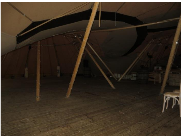
11. Tipi interior.