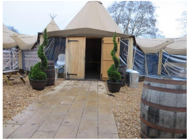
8. Entrance to tipi