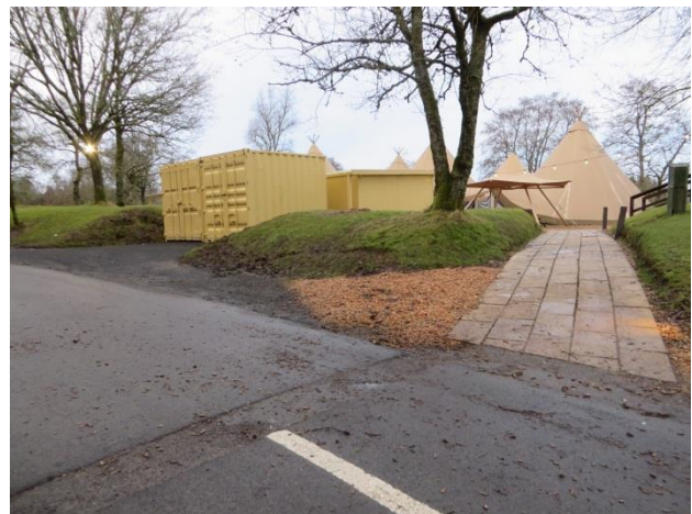
4. Graded route step free route to tipi.