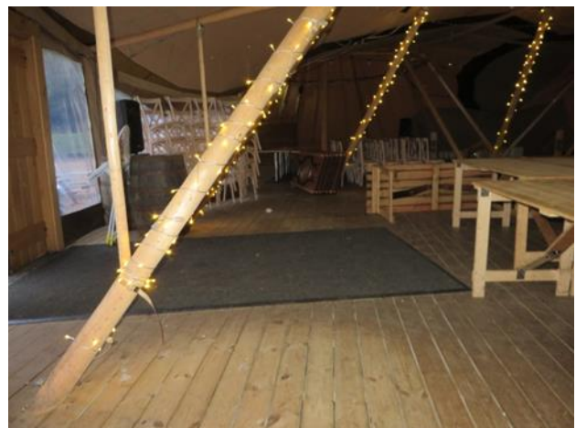
10 Tipi interior.