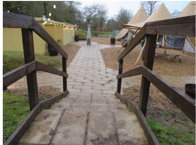
2. Steps down to tipi.