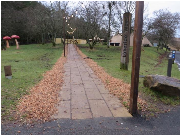
1. Approach route 1200mm wide, gradient approx. 1 in 20. Steps down at the end.