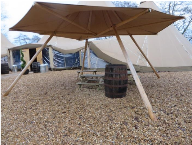
7. Loose gravel to covered seating area.