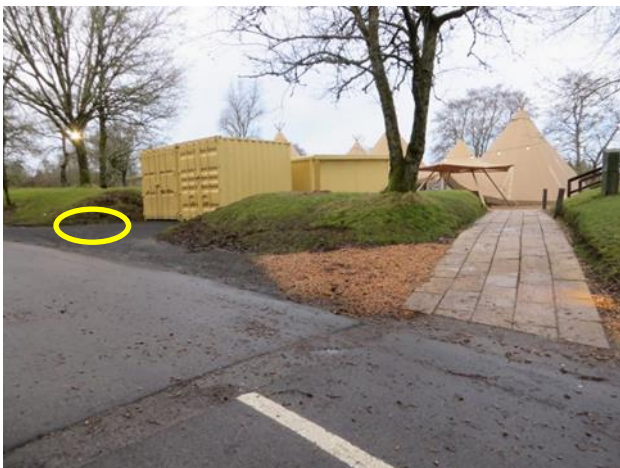
3. Parking space for disabled visitors by prior arrangement.