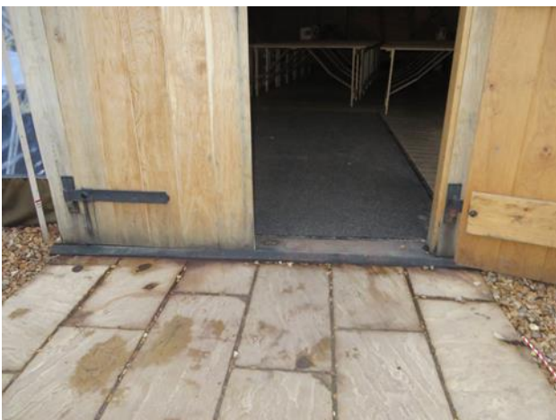
9 Entrance door raised threshold.