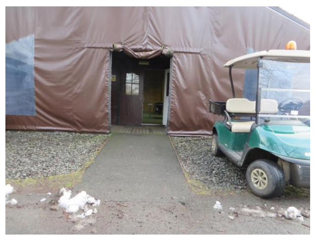
3. Approach to games room 1 in 17.