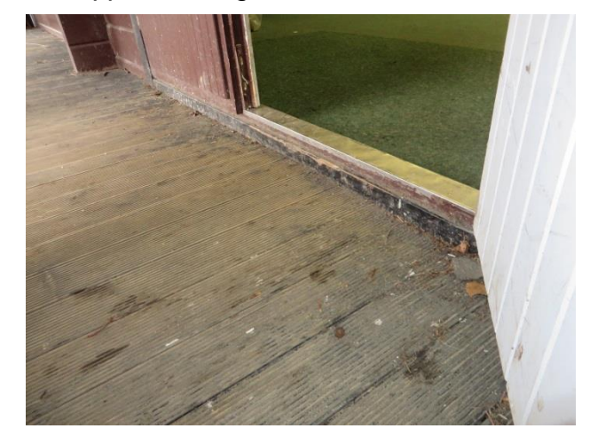
5. Raised threshold.