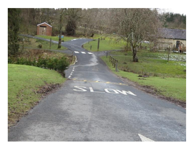
1. Route up from visitor centre