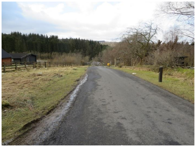
2. Route up from visitor centre