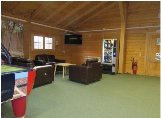
6. Internal space and