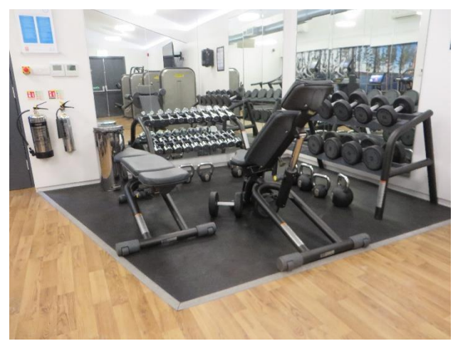
2. Weights and associated benches.