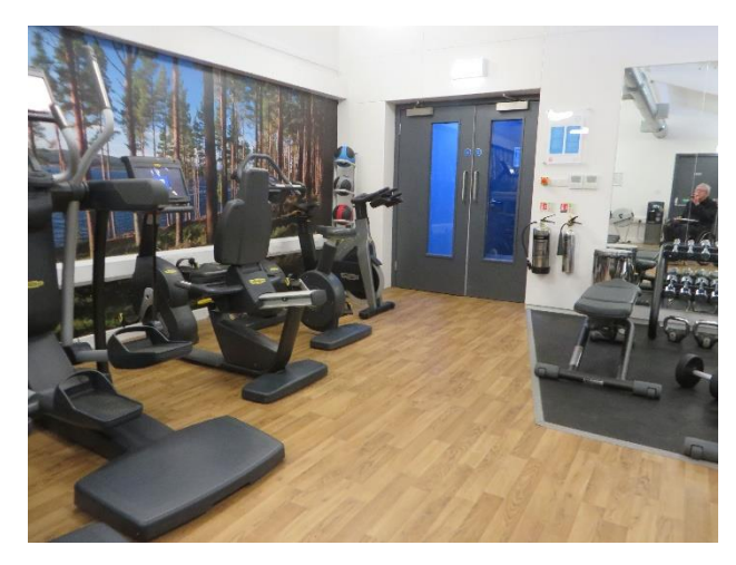
1. Door and circulation.