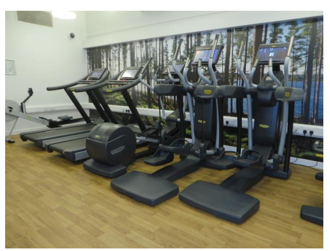
3. Gym Equipment.