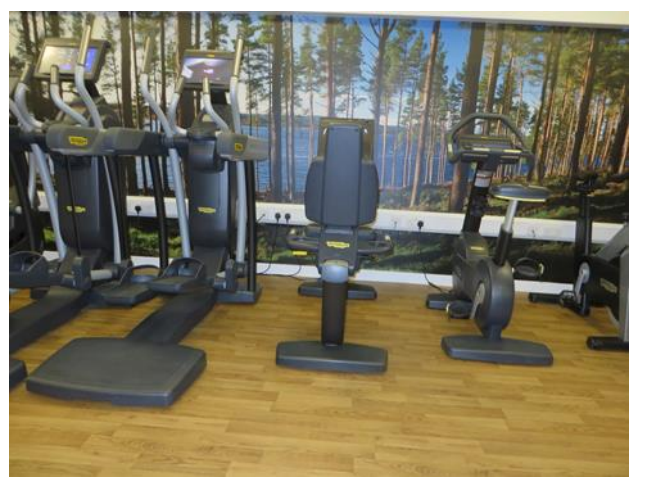
6. Gym Equipment.