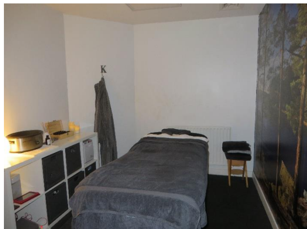
4. Treatment room interior.