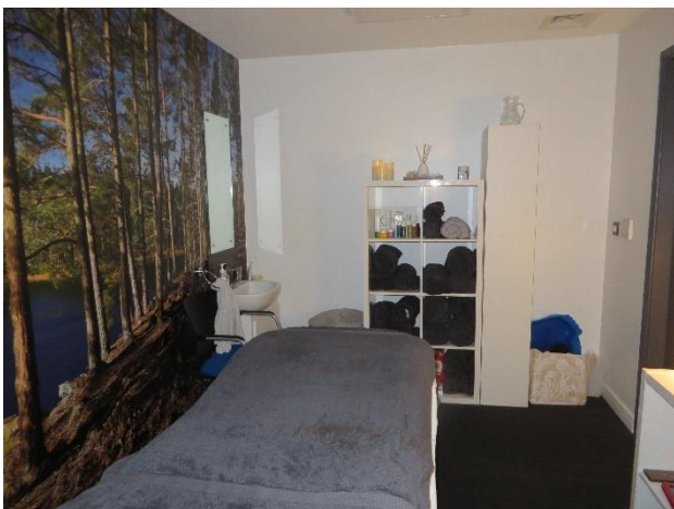
3. Treatment room interior.