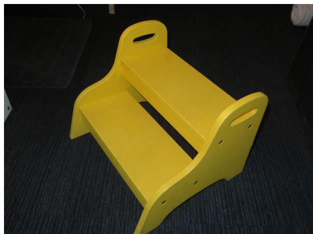
6. Portable step allows easier access to the bench for some people.