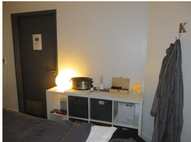
2. Treatment room interior.